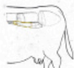
Fig. 5 Flank