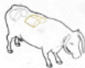
Fig. 2 Spine