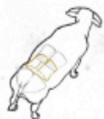
Fig. 3 Rumpbone T. Bone