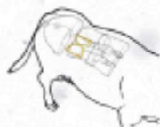
Fig. 6 Cholesterol