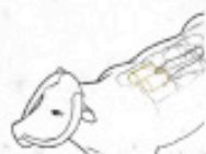
Fig. 1 Eye-eye