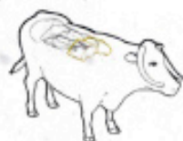
Fig. 4 Prime Rib