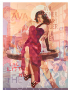
Ava Gardner: A Desirable Proposition