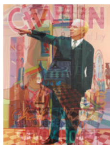
Charlie Chaplin: Silent Path to Success