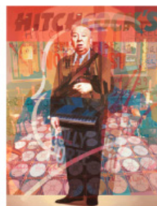
Alfred Hitchcock: The Mysterious Thinker