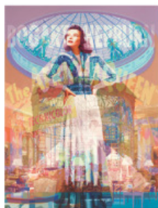
Katharine Hepburn: Taking Centre Stage

Each painting features a star of the stage or screen who enjoyed staying here at The Savoy.