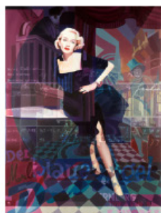
Marlene Dietrich: Into My World