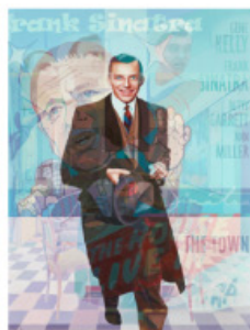
Frank Sinatra: Man About Town