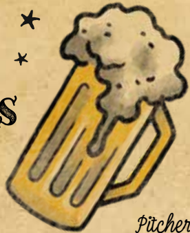
Pitcher / Pint